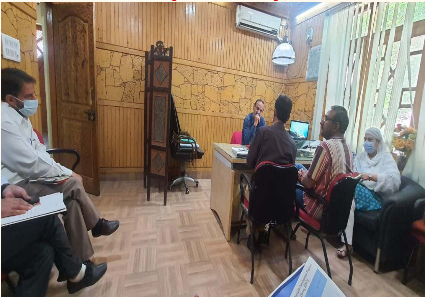
AREA MARKETING OFFICE JAMMU