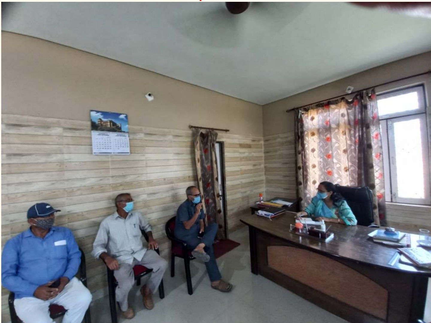
AREA MARKETING OFFICE DODA