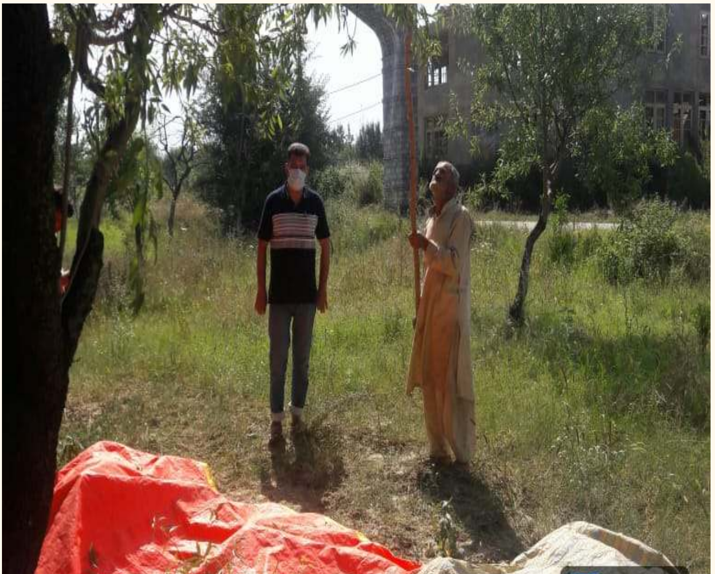
Harvesting of Almond at Zaloosa Chrarisharief

null, null, null Unnamed Road, 191113 Lat N 33° 55' 34.482" Long E 74° 45' 44.2008" 18/08/21 11:33 AM