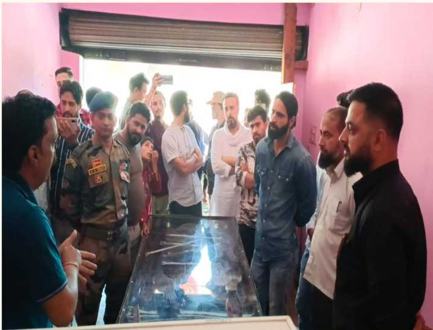
AMO Doda also on Saturday attended Public Grievance Redressal Camp chaired by D C Doda at Bhandarwah