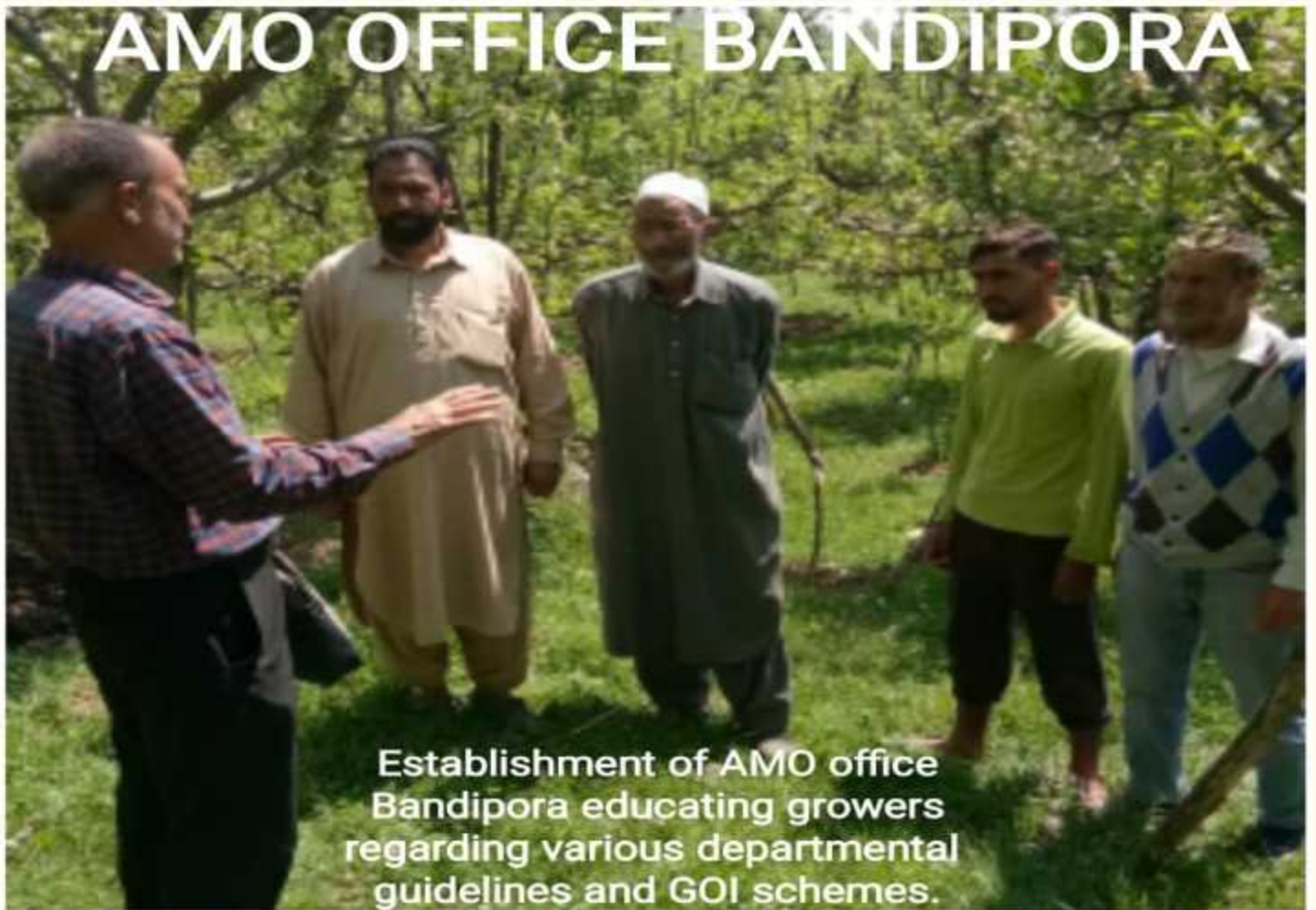
Establishment of AMO office Bandipora educating growers regarding various departmental guidelines and GOI schemes.