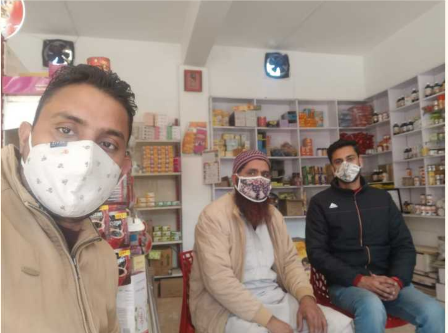
AGMO Bishnah held a meeting with BPM-NRLM Bishnah regarding finalization of branding/labeling & packing/ packaging material for produce of SHG