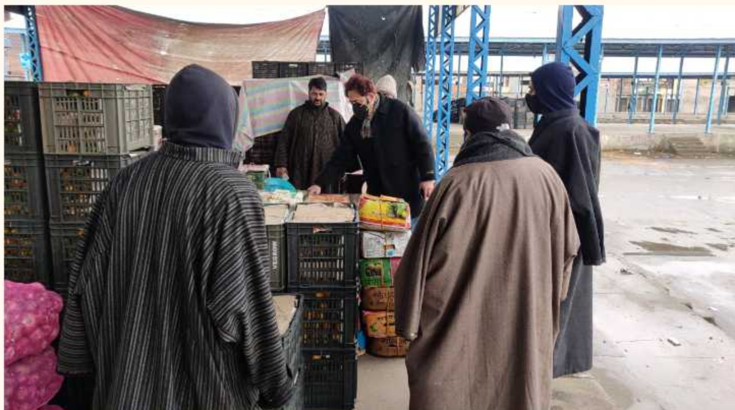
AREA MARKETING OFFICE GANDERBAL