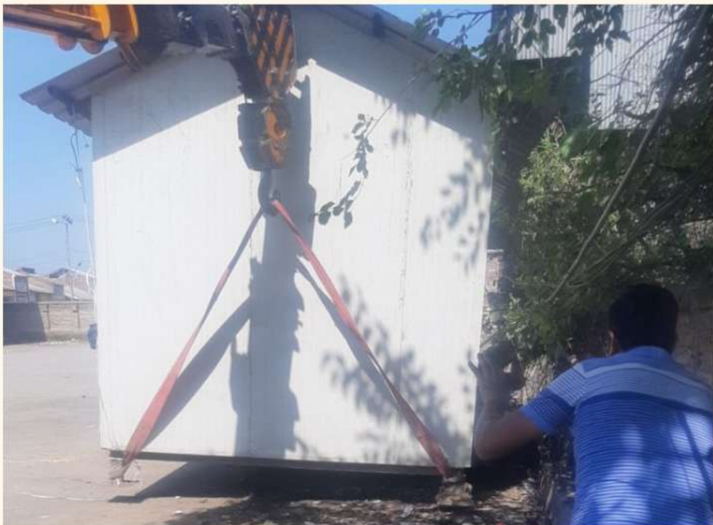
Final phase of demarcation in progress at Parimpora Mandi