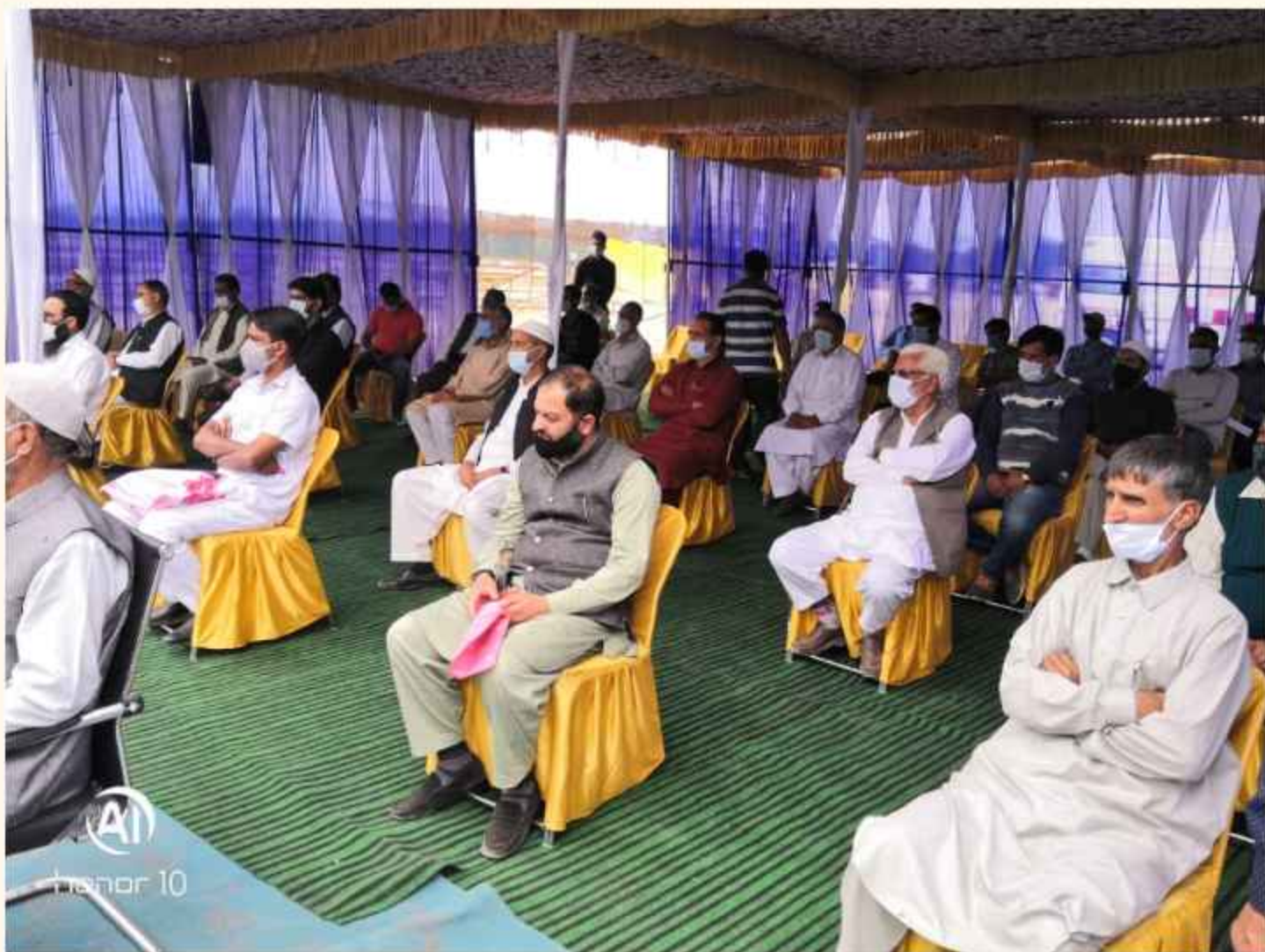
Dy. Director (K) in a meeting with the Officers/Officials of A M O Office Shopian