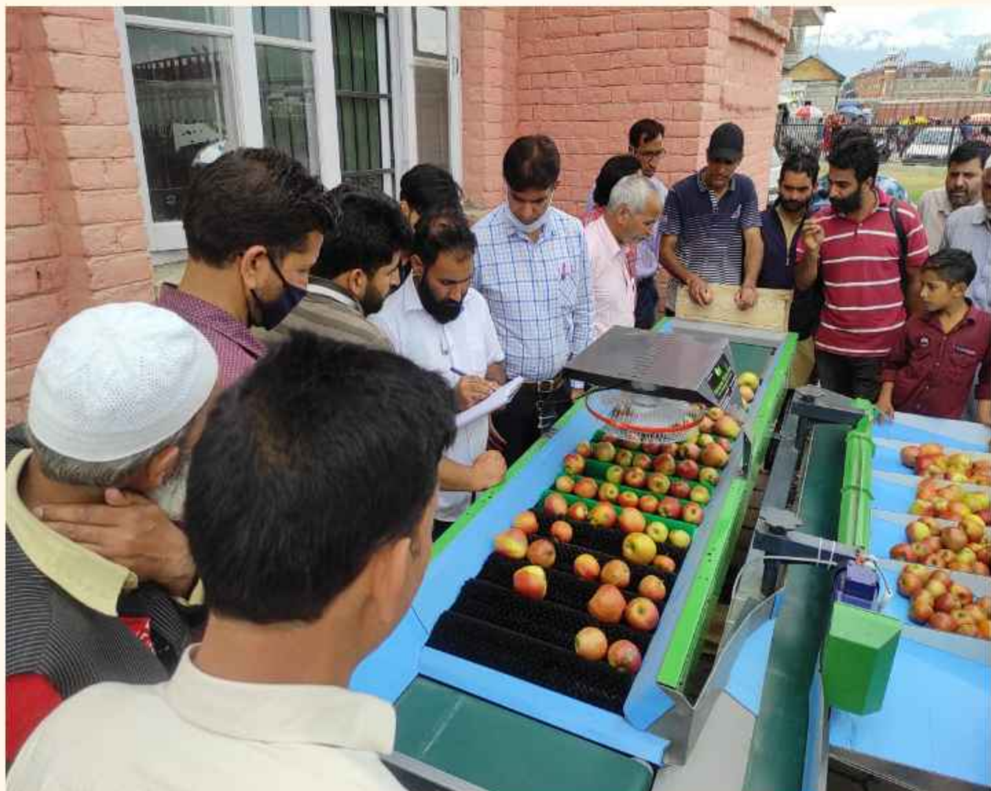
Meeting with CHO Baramulla regarding ODOP cases of Bla/Sopore