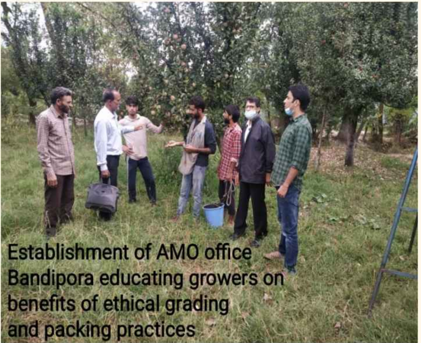
Establishment of AMO office Bandipora educating growers on benefits of ethical grading and packing practices