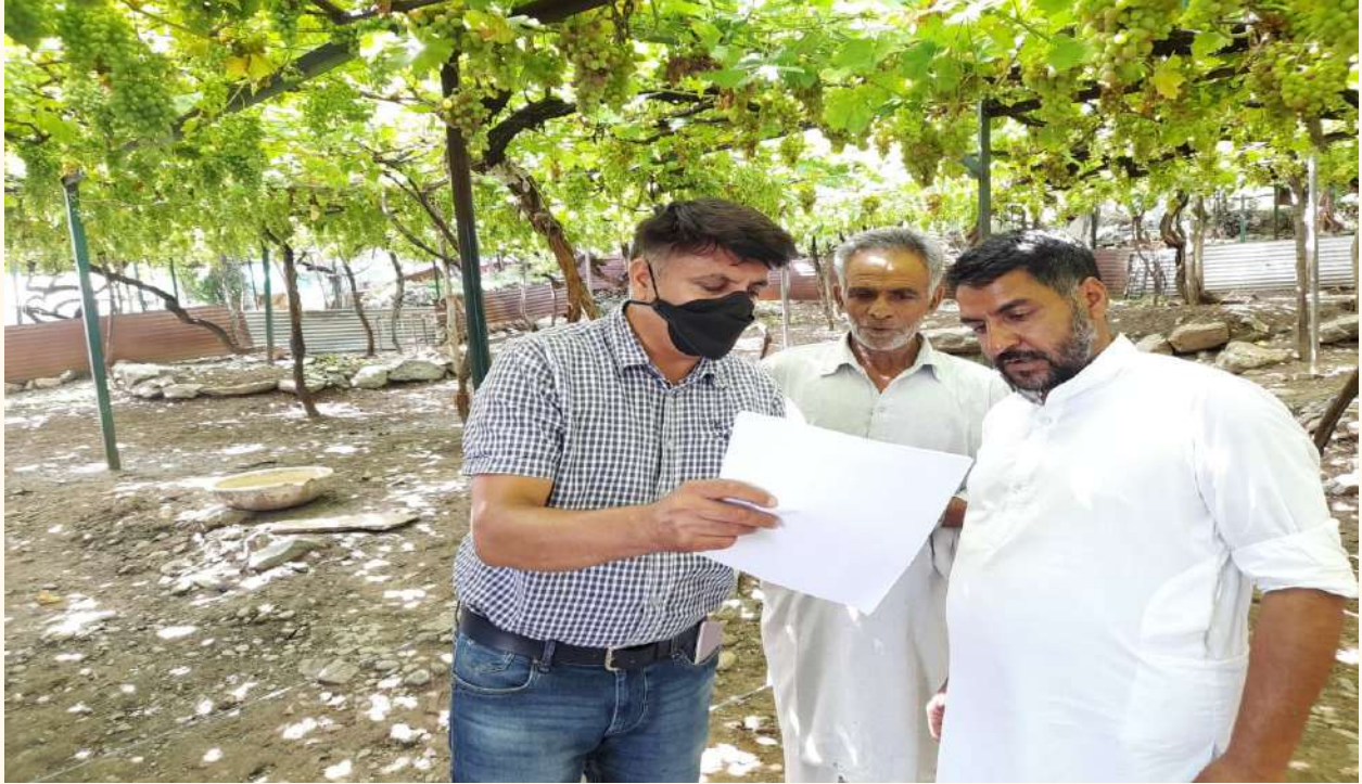
AREA MARKETING OFFICE JAMMU Officers/Officials of Area Marketing Office meeting President Fruit Association Narwal in connection with Swachh Mandi Abhiyan and cleaning process of Narwal Mandi underway