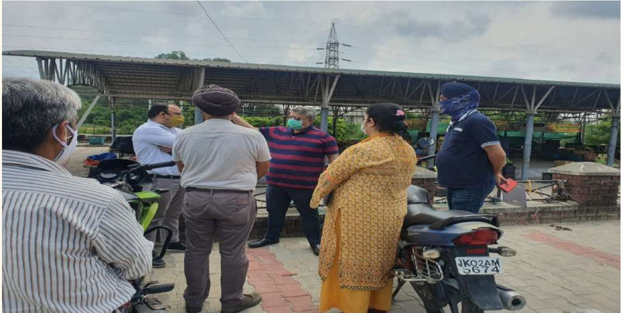
DEPUTY DIRECTOR KASHMIR on visit to Mega Fruit Market Aglar Shopian accompanied by the Officers/Officials of AMO Office Shopian and Chairman All Valley and President Fruit Association Sopore taking on spot review of the development works in the Market