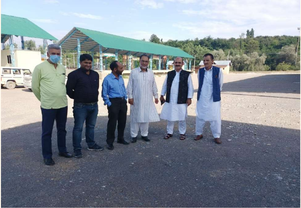
AREA MARKETING OFFICE KULGAM Area marketing Officer alongwith staff on cleaning drive in Fruit Market Kulgam in connection with Swachh Mandi Abhiyan