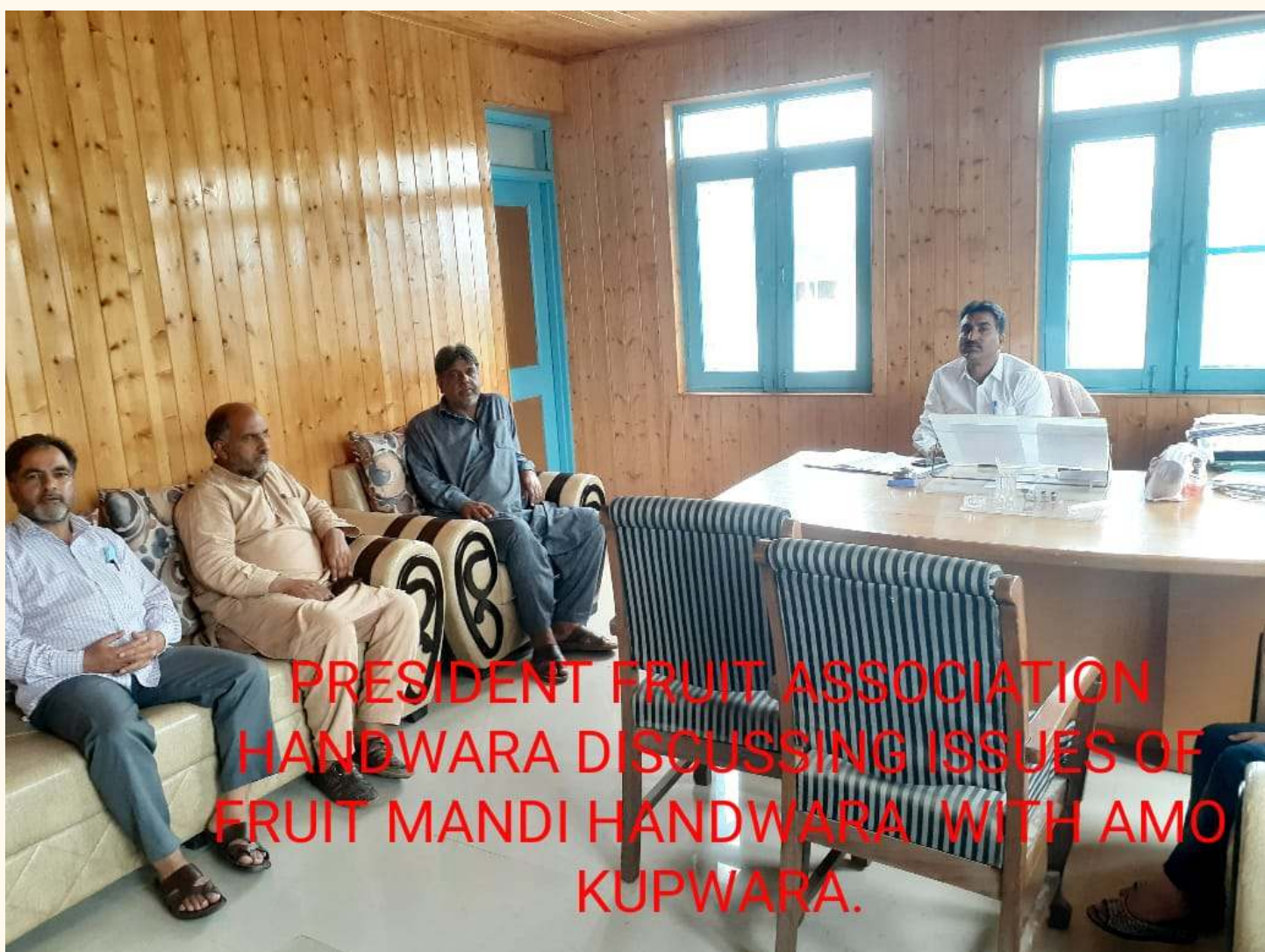
PRESIDENT FRUIT ASSOCIATION HANDWARA DISCUSSING ISSUES OF FRUIT MANDI HANDWARA WITH AMO KUPWARA.