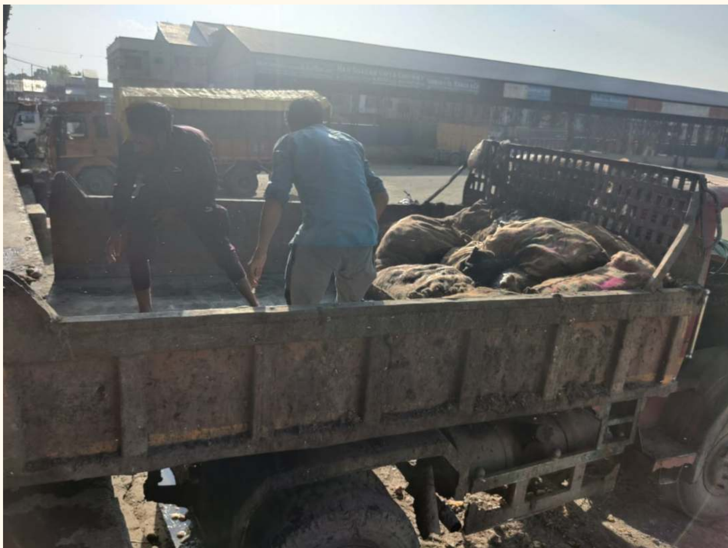
AREA MARKETING OFFICE KUPWARA Area Marketing Officer Kupwara along with staff in a meeting with Fruit Association Handwara and in field regarding Departmental Activities