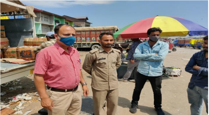
Verification of lease deeds in Mandi

Dussheri variety mangoes in parimpora mandi. Facilitated the seller and ensured that the farmer gets better returns.