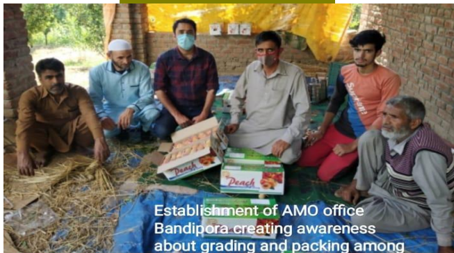
Establishment of AMO office Bandipora creating awareness about grading and packing among peach growers of Bandipora.