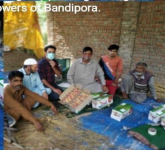
Bandipora team visited Nowgam area of the district and educated growers about harvesting and grading & packing of plum crop.