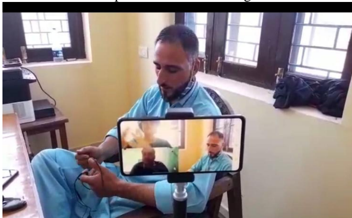
Meeting with Fruit Growers Cooperative Marketing Society Batwina Ganderbal

Facilitating Buyer Seller interaction through virtual mode as a part of direct marketing.