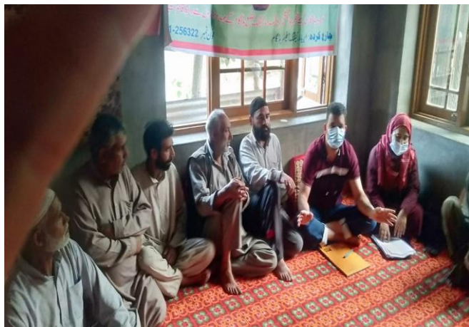
Attended ACR office Budgam in connection with farmer market.