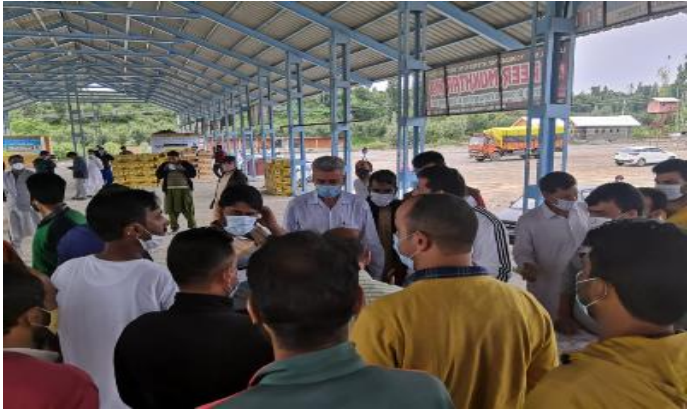
Newly elected President and General Secretary of Fruit Association Shopian called on AMO Shopian.