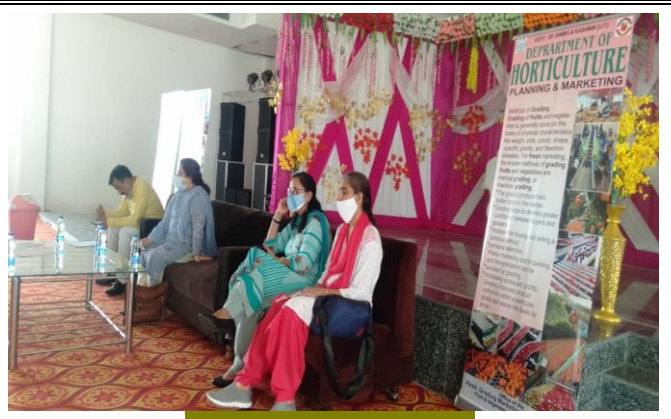
AMO PULWAMA e-NAM registeration