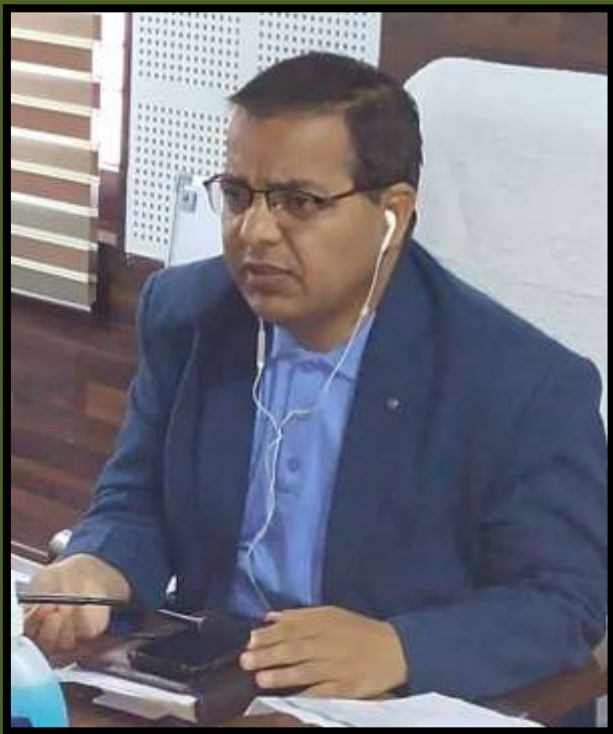
DIRECTOR HORTICULTURE (P&M)