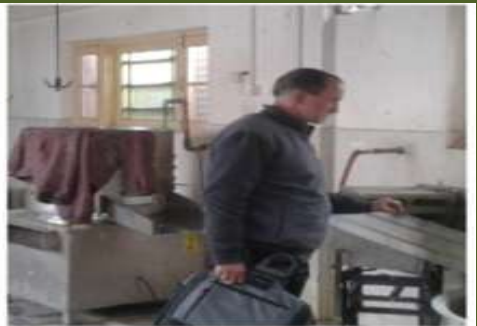
VISIT TO THE EXISTING UNIT REGARDING MOTIVATION FOR PMFME ODOP