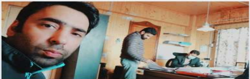
Updating CPO Bandipora regarding status of ODOP cases