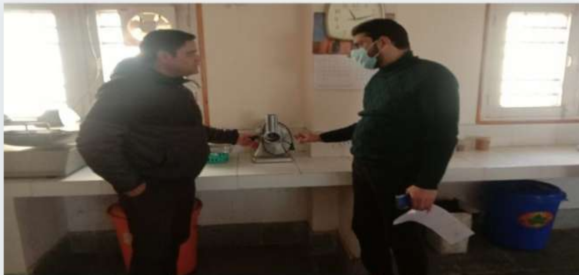
EXPOSURE VISIT TO MODEL CHICKEN PROCESSING UNIT AT SKUAST-K