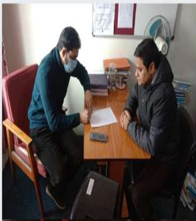
CONSULTATION REGARDING ODOP DPR FORMULATION WITH SCIENTIST SKUAST-K