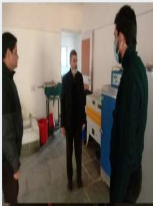
EXPOSURE VISIT TO MODEL CHICKEN PROCESSING UNIT AT SKUAST-K