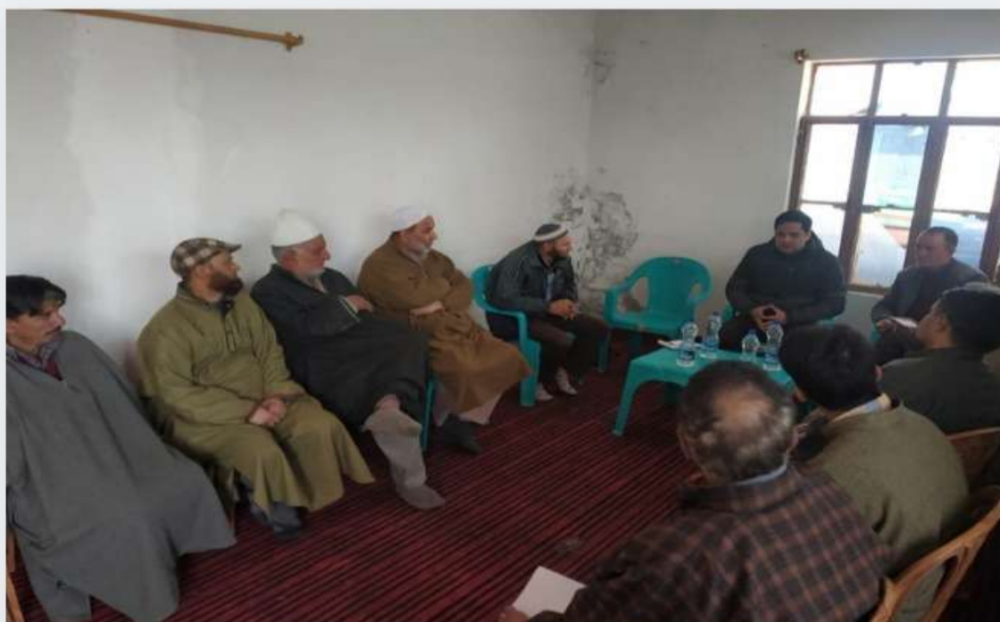
MEETING WITH GROWERS BODY AND SARPANCH