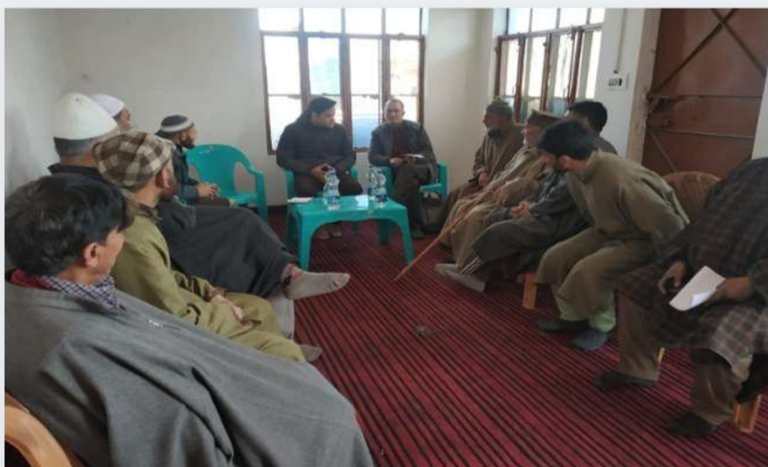
MEETING WITH GROWERS BODY AND SARPANCH