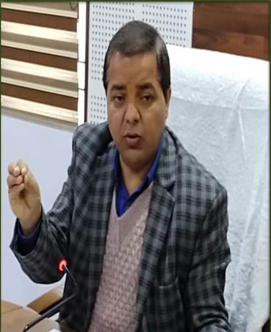
DIRECTOR HORTICULTURE (P&M)