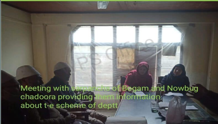
Meeting with sarpanchs of Begam and Nowbug chadoora providing them information about t-e scheme of deptt