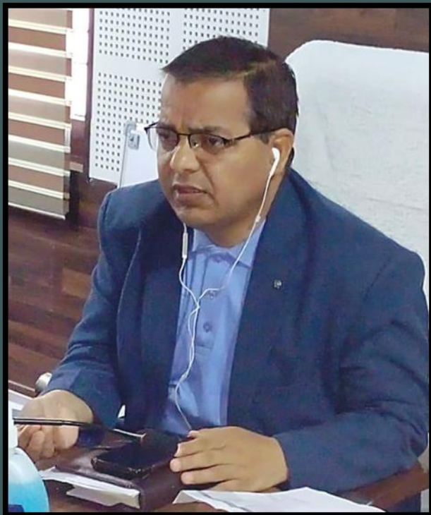
DIRECTOR HORTICULTURE (P&M)