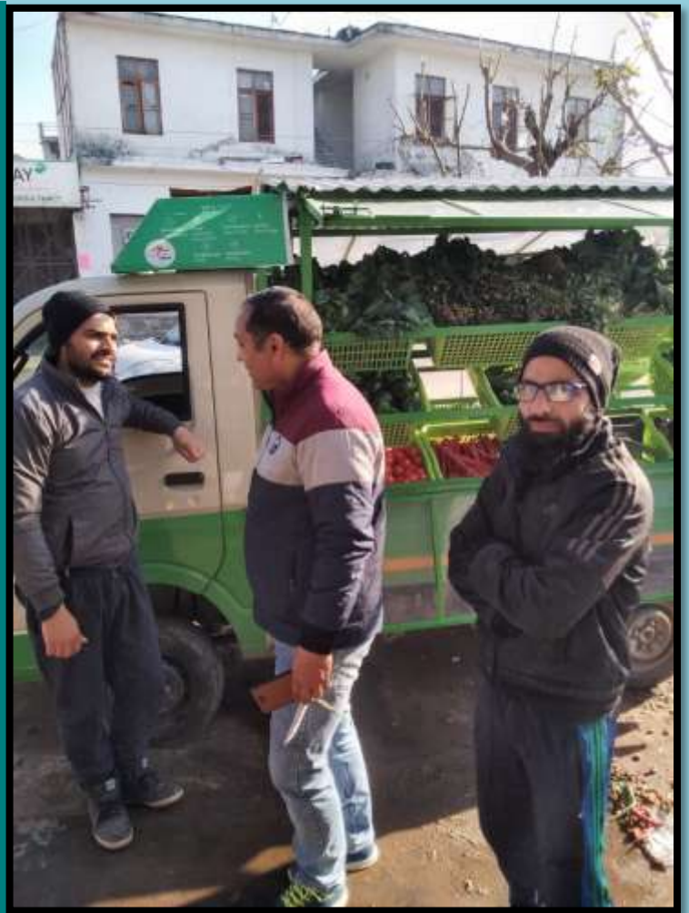
Deputy Director (Central) on field visit