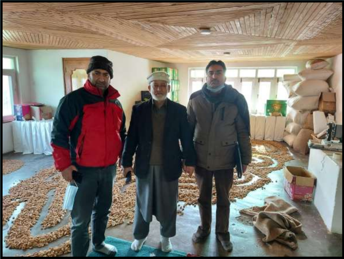
Field visit regarding ODOP at Halmatpora Kupwara