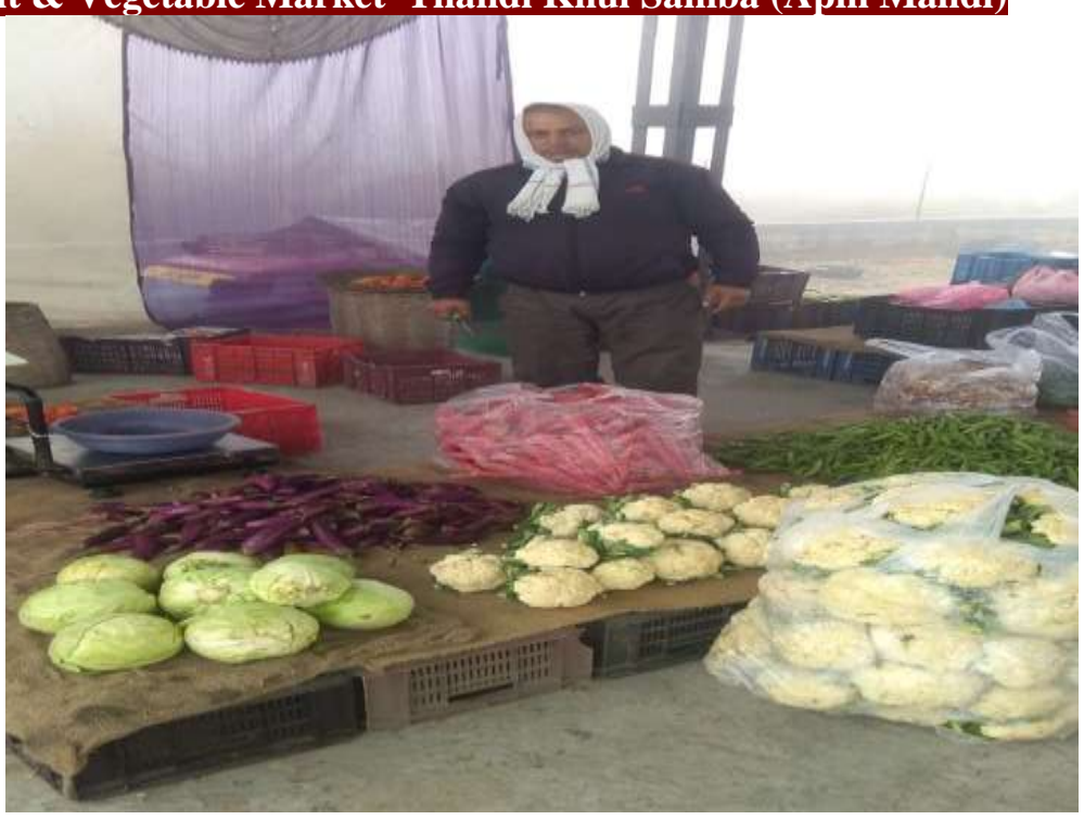
Fruit & Vegetable Market Thandi Khui Samba (Apni Mandi)