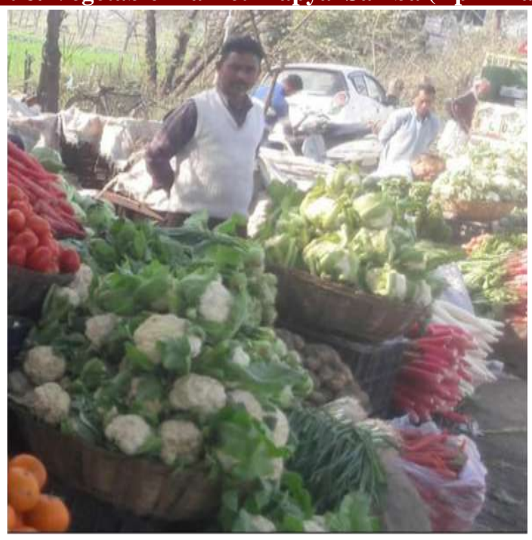
Fruit & Vegetable Market Tapyal Samba (Apni Mandi)