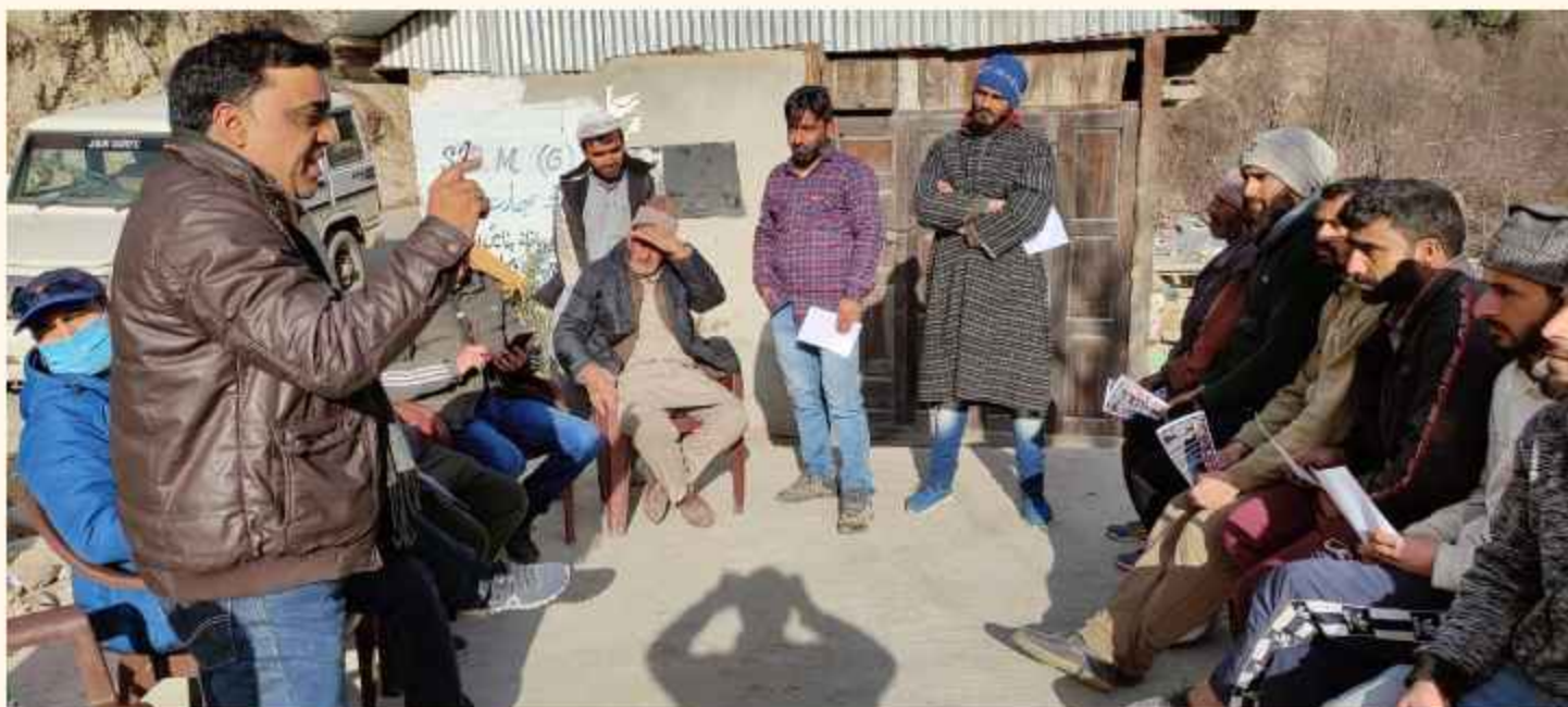
The Officers/Officials also conducted an evening chopal at Beli & Janjalwar Panchahats and educated the participants about cooperatives and other Departmental Schemes