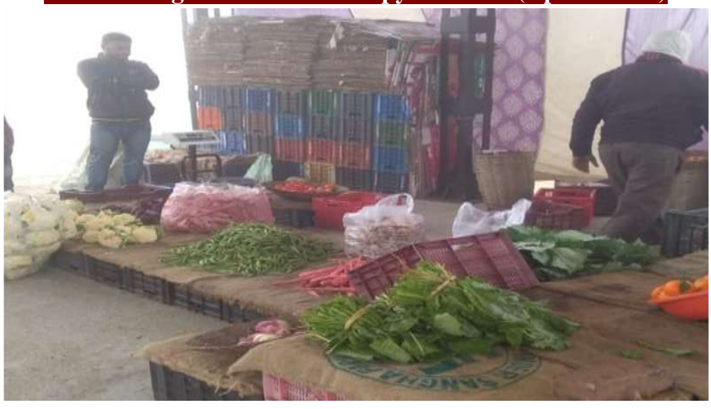
Fruit & Vegetable Market Tapyal Samba (Apni Mandi)