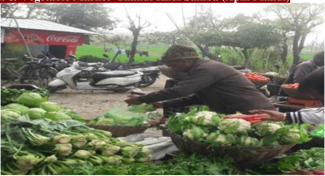
Fruit & Vegetable Market Thandi Khui Samba (Apni Mandi)