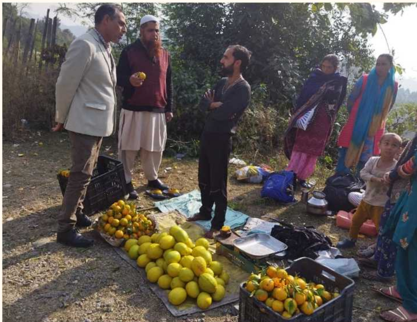
Team Reasi under the leadership of AMO Udhampur interacting with farmers, PRIs and SHG members at Apni Mandi Puria and insisting them for making the Mandi functional