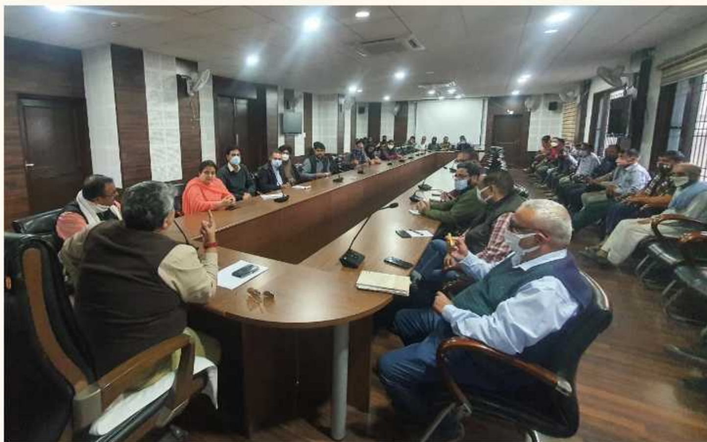
Deputy Director Kashmir addressed the traders and growers on the occasion of issuance of seasonal licences to traders at Fruit Mandi Sopore