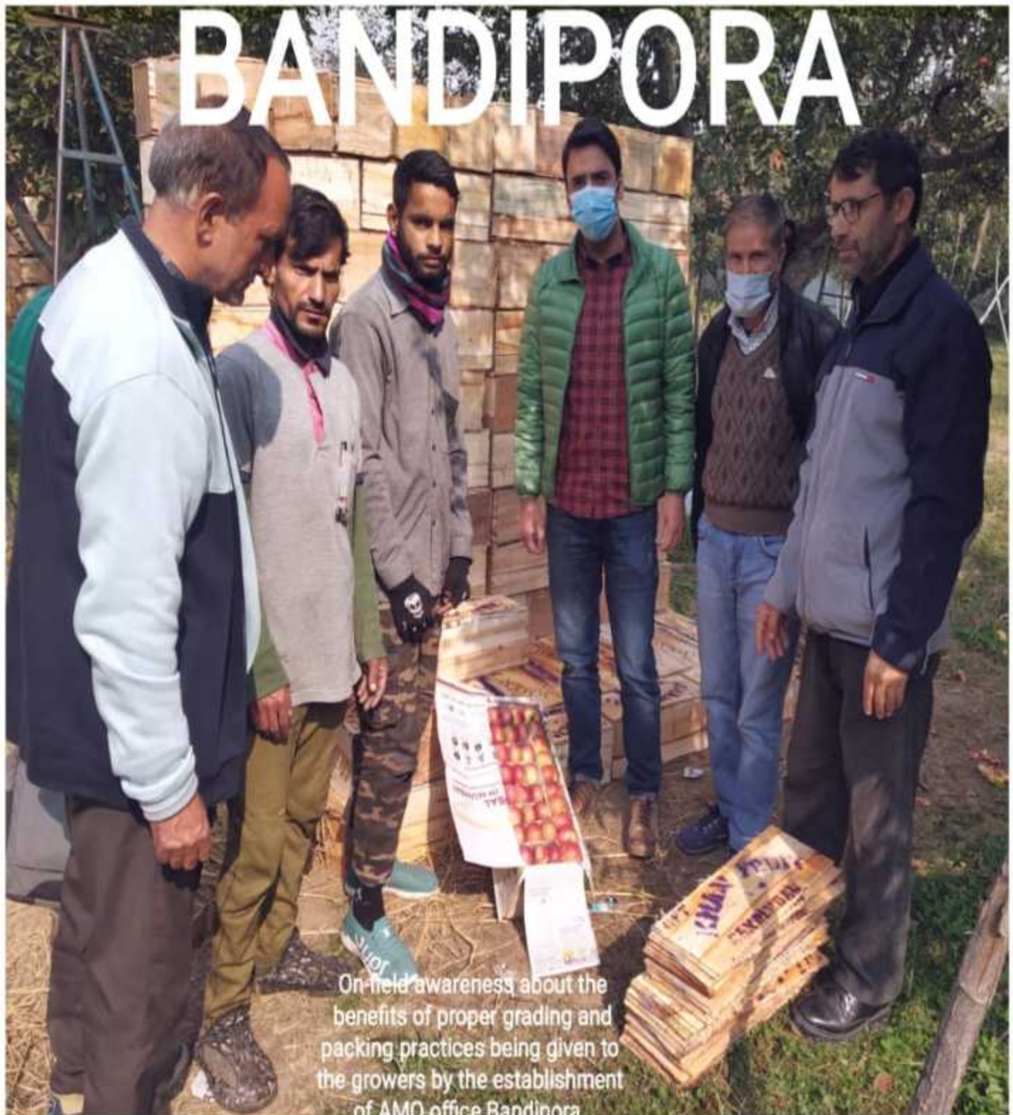
On-field awareness about the benefits of proper grading and packing practices being given to the growers by the establishment of AMO office Bandipora