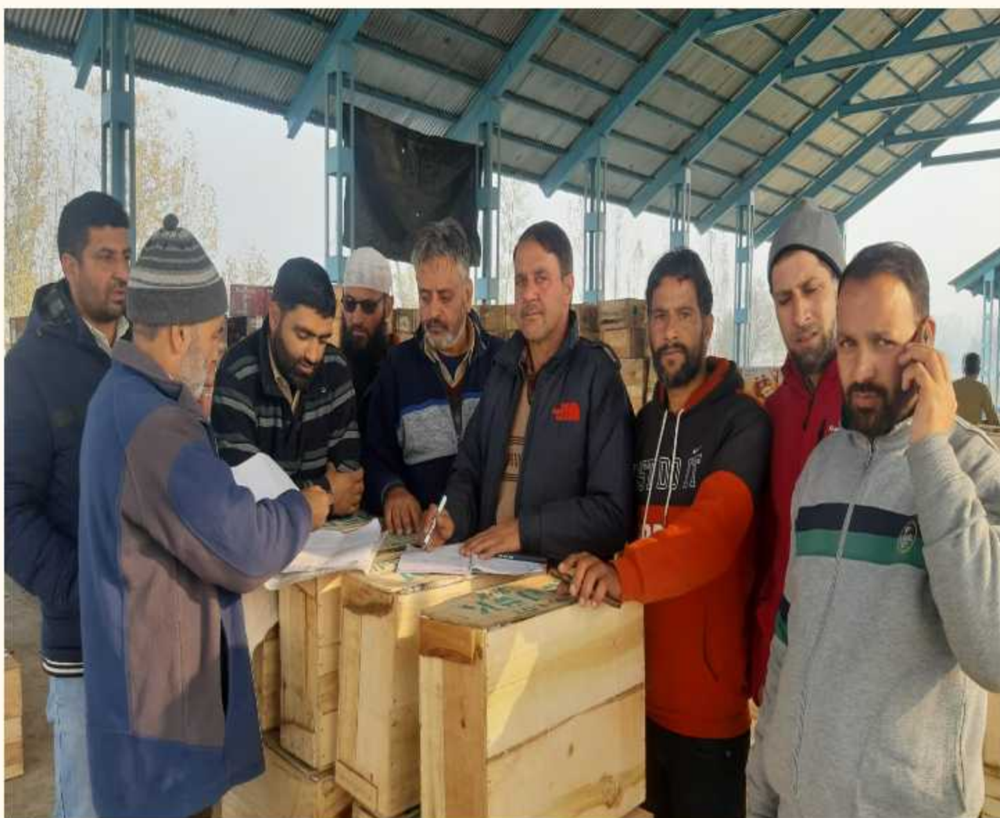
AMO Anantnag on Wednesday attended meeting with SDM & Tehsildar Bijbihara regarding issues pertaining to the land acquisition of Jablipora Fruit Mandi