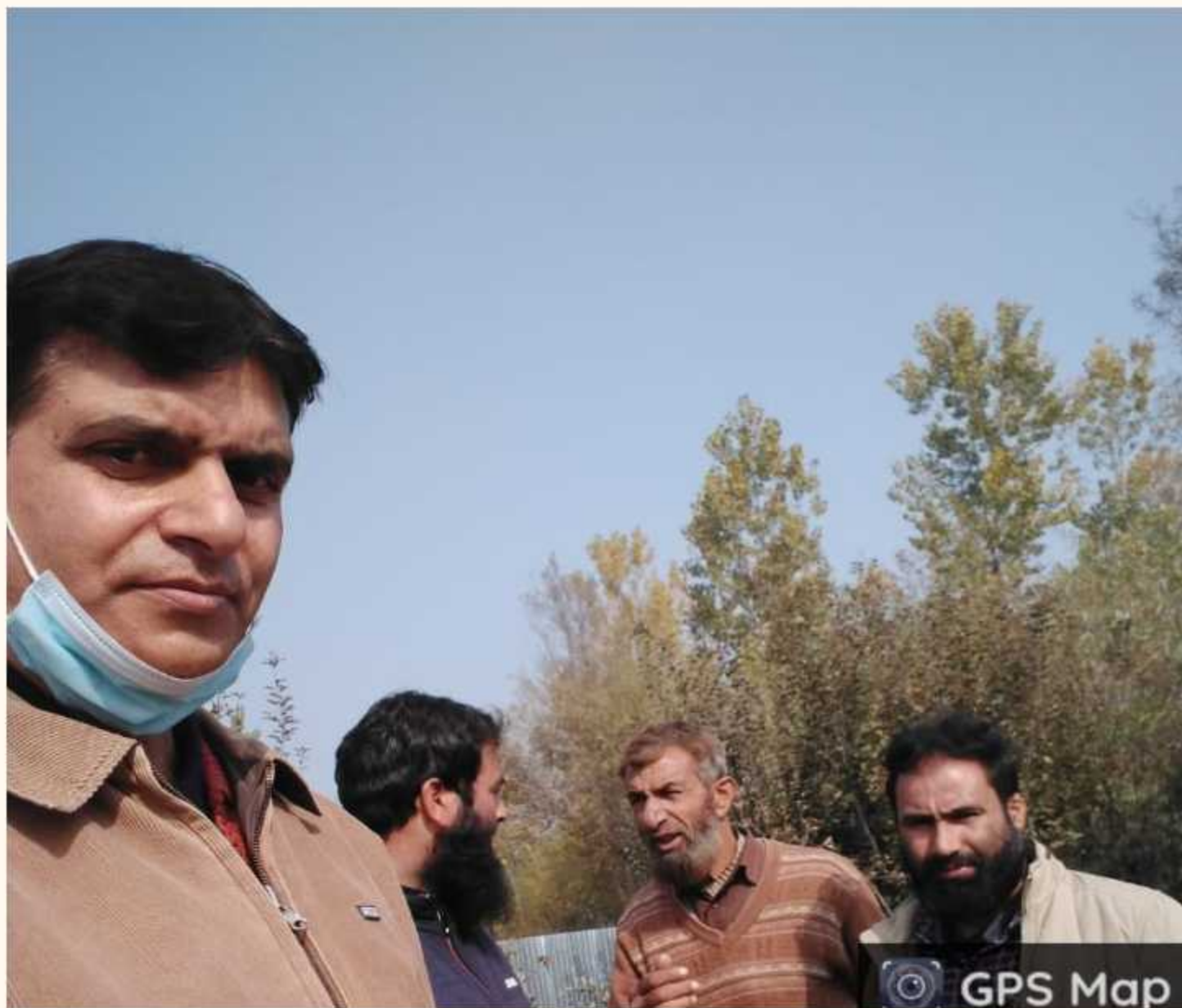
Officials of the AMO Office Sopore along with Officials of Revenue Department visited Bagh e Sundri for demarcation of Approach Road as some queries were raised by concerned growers