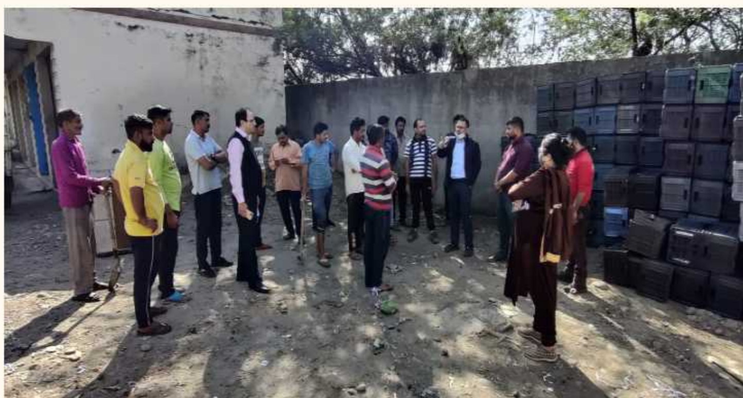
Officers/Officials of AMO Office Jammu meeting traders in connection with trading on e-NAM