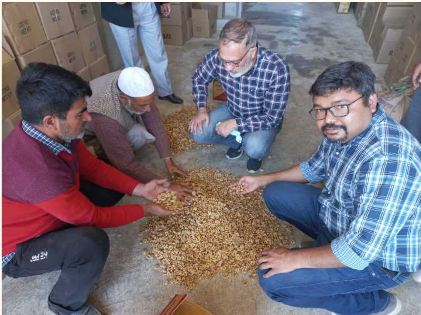
A M O Kupwara, A D G&P along with team of Intello Labs Pvt Ltd in a meeting with Deputy Commissioner Kupwara