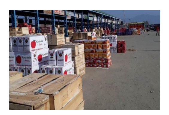
Daily Wholesale rates and dispatches of Fresh Fruits from Fruit & Vegetable Market Sopore Today on 24<sup>th</sup> of August-2020