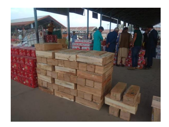
Daily Wholesale rates and dispatches of Fresh Fruits from Fruit & Vegetable Market Sopore Today on 25th of July-2020